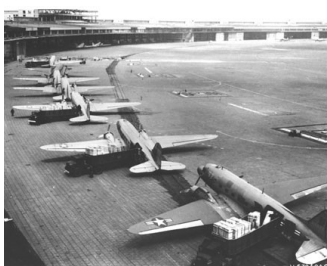
Planes waiting to take off from a Berlin airport

Many problems arose after the war was over. One of them focused on the city of Berlin which was deep inside the Russian zone. In June 1948, the Soviet Union tried to drive the western powers out of Berlin by blocking all routes to the city. For a whole year the Allies flew in food, fuel and other things that the population needed to survive . Finally , the Russians gave up and the blockade ended. In 1961 the Russians built a wall around Berlin to stop their citizens from escaping to the west.